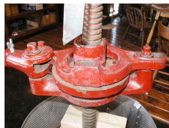
(Here you see the keys in the downward position)

Now you want to install the ratchet keys into the ratchet assembly. This is a key part of the process, as in one orientation the keys will drive the head assembly downward and in the other position they will move it upward to relieve the pressure when you are done pressing this lot. Below you will see the orientations for the two directions of movement.