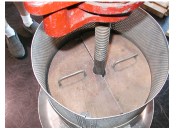
(Install the half-circles)