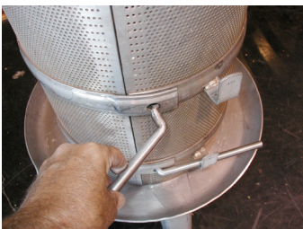
(assemble the basket)

Once the press is sanitized, it is time to get to work. A small, 1 or 2 gallon bucket is the easiest way to transfer the wine from your fermenter into the press - be sure that it and your hands and forearms are sanitized as well (this is one reason that MoreWine! prefers StarSan (CL26) to strong sulfite solution for sanitizing). Place the two halves of the basket itself onto the base of the press and lock them in position with the provided pins.