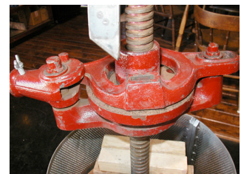
(Here you see the keys in the upward position)